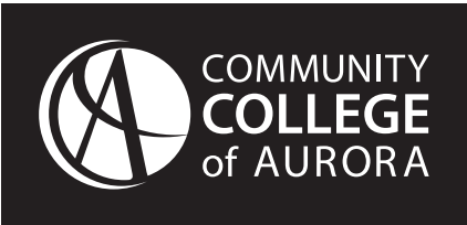
WHITE VERSION Use all white logo on dark or textured backgrounds.