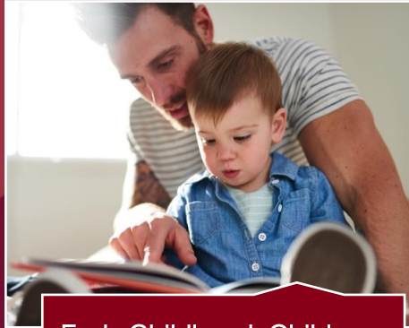
Early Childhood, Childcare Adolescent, Teen