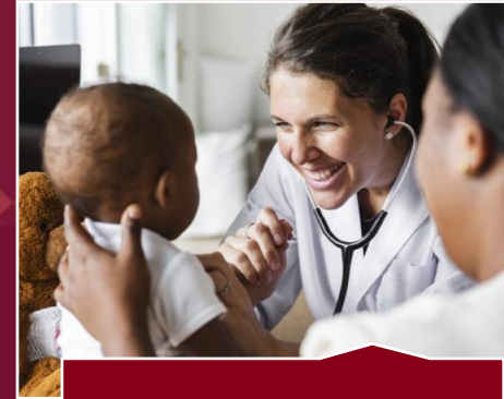
Health and Wellbeing